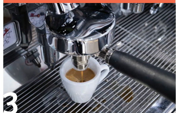
3 Press the dose button.