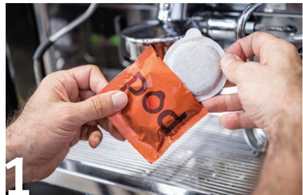
1 Remove pod from Individual pouch.

ESE Pods are made from 100% fresh ground coffee