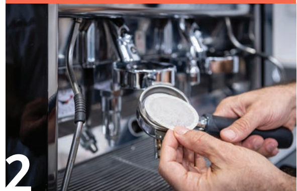
2 Place pod in group Handle and Connect to the group head.