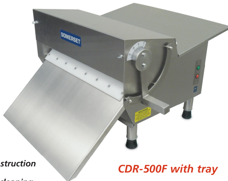
CDR-500F with tray